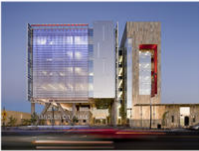
View of office tower from west - Photo Credit: SmithGroupJJR