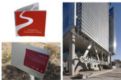
Images of “Sustainability Pathway” and “Turbulent Shade” façade system

A very accessible dialog of sustainability has been interwoven into the project through two key elements. A poet and graphic artist created the “Sustainable Pathway,” which provides visitors a self-guided tour of the building's sustainable elements marked by descriptive signs and noting whether the strategy is socially, economically or environmentally focused. A public artist created “Turbulent Shade,” an shading element that is very much connected to the physical environment by moving with the wind. Sustainability is on display for the community to interact with.