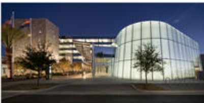
View looking at council chambers and office tower from southeast