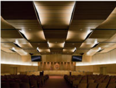
Council Chambers