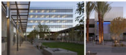
Views of courtyard and cooling tower water feature

As with any facility located in a desert region, water conservation is critical. The Chandler City Hall complex has taken a comprehensive approach to reducing potable water use. Both interior and exterior strategies were employed. The interior approach utilizes low-flow water-conserving fixtures, while the exterior approach utilizes high-efficiency drip irrigation and low-water-use native plants. The project also focused on the process side by capturing “blow-down” water from the operation of the cooling towers and the condensate water from the HVAC systems. Large volumes of water normally get dumped down the sewer when employing cooling towers. This water is non-chemically treated and reclaimed for the purpose of supplementing irrigation and waste conveyance. During the summer months, there is an excess of water generated, so no potable water is being used for interior or exterior systems. Less water is generated during the winter months, which requires some potable water.