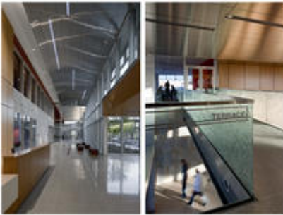
First level public lobby space and second level balcony