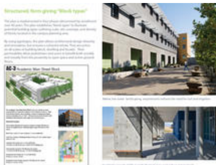
Sustainability Strategies