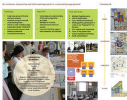
Developing the Plan

Development of this plan was an inclusive, democratic effort among dozens of stakeholders. Workshops held over 18 months with students, faculty, staff and the general public provided critical input during the planning process. Flagship events among faculty, staff, students and designers were the actual genesis of the plan's sustainability targets.