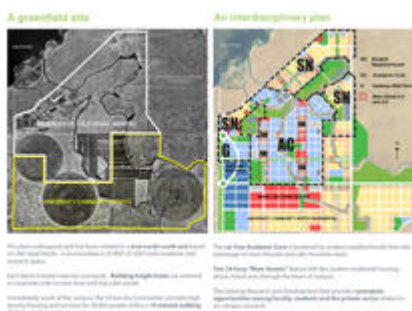
Land Use Plan - Photo Credit: UC Merced