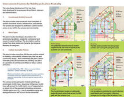
Circulation Pattern