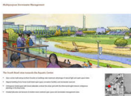
South Bowl