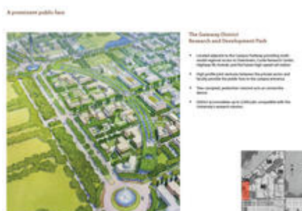
Gateway District