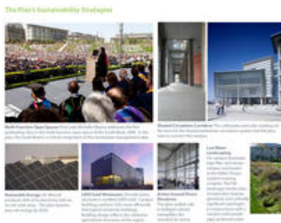
Sustainability Strategies - Photo Credit: UC Merced

The Coast Ranges to the west buffer the site from Pacific Ocean weather systems. Summer temperatures are warm to hot and arid, with clear skies, no rainfall and cool evenings. The winters in Merced are mild, with occasional rains and frequent, heavy fogs. In the winter, 30 days of fog are not unusual. Winds come from the northwest during the summer and the southeast during the winter.