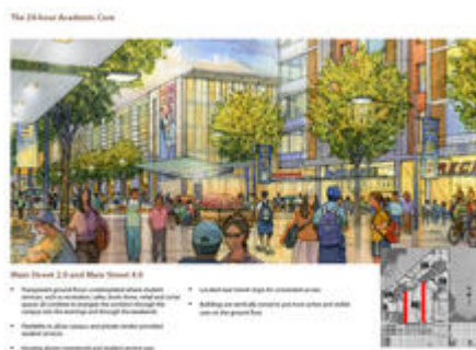
Main Street 2.0