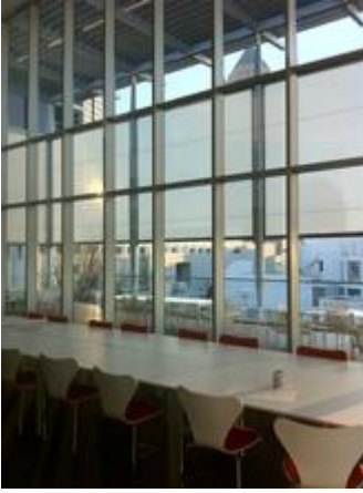
1315 Peachtree Street 5th Floor with Exterior Shading