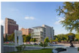
Exterior Elevation Photos