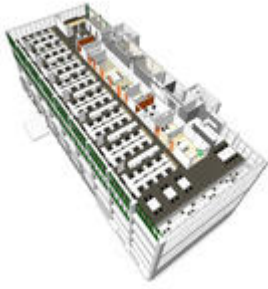
3rd Floor Plan Perspective (Typical)