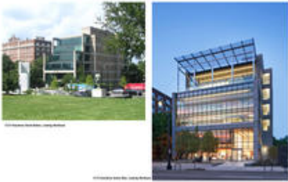
1315 Peachtree Street Before and After

Located in the heart of Midtown Atlanta, the original project was designed with two curb-cuts on Peachtree Street and a semi-circular drive leading to a street-level parking garage. This was hazardous to pedestrians and an underuse of valuable street-level real estate. The design team removed the curb-cuts, creating a permeable civic plaza and eliminating 1/3 of the building’s parking.