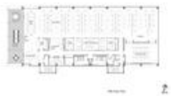
Plans 4-5 - Photo Credit: Perkins+Will