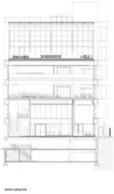
Section Looking East