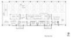
Plans 1, 3