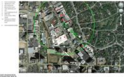
Context Plan