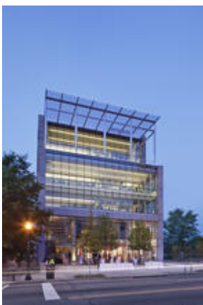
1315 Peachtree Street Exterior