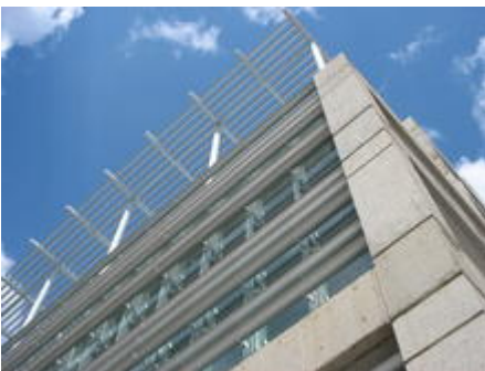
1315 Peachtree Street West Facade Shading

The best opportunity for positive environmental impact was to select an existing building, retain as much of the structure as possible and upgrade and optimize systems such as exterior glazing, HVAC, lighting and water. In order to reduce the amount of demolition and construction waste sent to the local landfills, the team set a target that 75% of waste generated would be reused, repurposed, recycled or otherwise diverted. The owner commits at least 1% of their firm-wide hours pro bono to organizations needing design services. By reaching out to many of these organizations, needs for furniture and materials were matched with salvaged items from the building's previous build-out. As a result, 80% (120,000 pounds) of demolition and construction waste was diverted from landfills or recycling yards to more than 20 local nonprofit organizations.