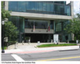
1315 Peachtree Street Existing Conditions