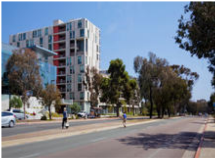
View looking south on Torrey Pines Road