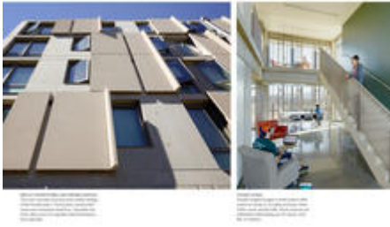
The cast-concrete structure from the outside, and a double-height lounge

The most significant reduction of energy on this project comes from the elimination of air conditioning based on scientific validation of the effectiveness of the proposed design. Both building mass and envelope are designed to manage solar gain and nighttime cooling and to ensure effective natural ventilation.