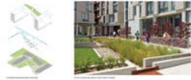
Stormwater management and habitat creation