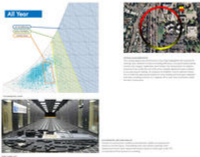
Psychrometric, wind and solar analysis informed the design