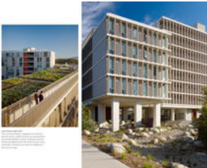
Bioremediation via green roof and bioswales - Photo Credit: Tim Griffith

Rain events at UC San Diego are infrequent, but are often dramatic downpours that produce high volumes of runoff which, from this position atop the Pacific coastal bluffs, cause erosion to the fragile coastal scrub arroyos, a particularly threatened ecosystem. To counter this damage, the apartments use the natural slope of the site to provide limited natural infiltration, reducing the quantity of water and increasing the quality of the water released into the ocean. Water from the roof and a nearby parking lot is channeled and daylight through retention basins and bioswales.