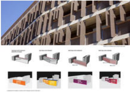
Comparison of energy savings with different shading and massing options

The building functions as a selective environmental filter, enhancing the best components of the regional climate to address heating, cooling, and ventilation needs, while rejecting the elements that jeopardize occupant comfort. The coastal location experiences highly regular afternoon breezes. To optimize the cooling effect, the building mass and window openings were shaped and sized to best capture the breezes based on landscape-scale CFD modeling. To ensure occupant comfort, an easily ventilated single-loaded corridor scheme was generated and a scale model was wind-tunnel tested, with the resulting pressure differentials on the envelope used to inform the interior layouts and ensure adequate interior ventilation.