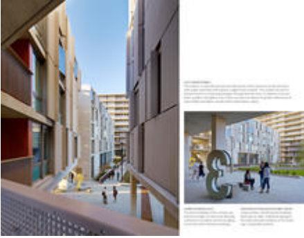
Outdoor circulation promotes social interaction - Photo Credit: Tim Griffith