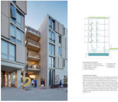
Wastewater recycling schematic

Water conservation was a top priority for this project, as it is both a scarce resource in Southern California and requires a significant amount of energy to transport from its distant source. The design response was two-fold, first focusing on conservation, and second on recycling. The conservation measures included water-efficient landscaping and a full suite of efficient plumbing fixtures, such as low-flow toilets.