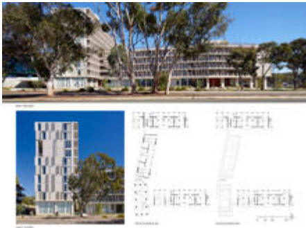
Plans and elevations - Photo Credit: Tim Griffith