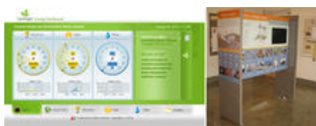
Earthright Energy Dashboard (left) displays current building energy use online and on-site on an informational kiosk (right) - Photo Credit: Delta Controls (left), Opsis Architecture (right)

Energy, daylight, electric lighting and solar access were all modeled during the design of the building. Different configurations of skylights and clerestory windows were examined in both the daylight and the energy models, and these models were essential in finding a balance between benefits for both these systems.