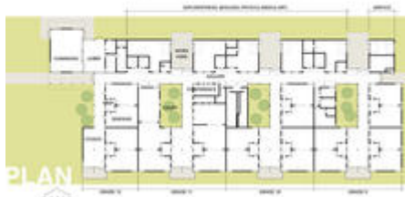
This computer rendering shows floor plans as well as 3D views of sections. - Photo Credit: Studio E Architects

The facilities are designed to help each student do well, support each family to lead healthier lives, and provide increased opportunities for everyone to participate. High Tech High demands that a school be safe, but not in a way that feels like a prison. Schools should be healthy, but not in a way that feels sanitized. Schools should be cost-effective to operate, but not at the expense of discomfort or functionality.