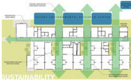
The diagram shows various sustainability features of the building. - Photo Credit: Studio E Architects