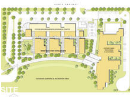
This drawing of the site plan shows the future home of surrounding buildings. - Photo Credit: Studio E Architects