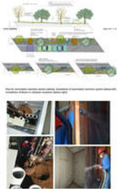
A computer rendering explains the stormwater retention system (above). Photos show installation of the stormwater system and blown-in cellulose insulation.

100% of storm water is captured on site. Most of the water is captured by the green roof and is returned to the groundwater after being cleaned of pollutants. All other storm water is collected in a subsurface infiltration system.