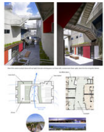
Two photos show views of the central courtyard (above).