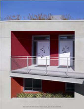
A detail view of the unit entries is depicted in this photo, which also shows green roofs above and below. Operable transom windows above the entry doors promote cross-ventilation.