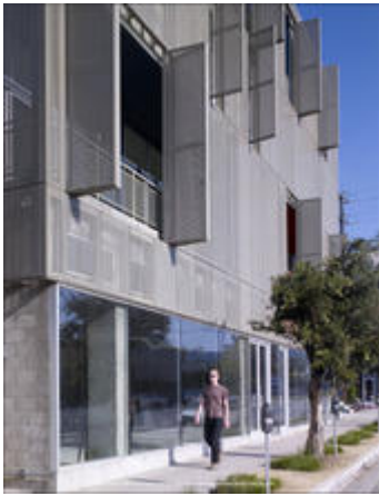
A detail view of the retail space and facade system are seen in this photo, including a planted median with an underground stormwater retention system.