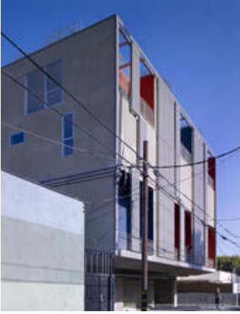
The view from the alley, as seen in the photo, shows shaded balconies and the green roof above.