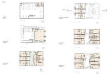
These drawings show floor plans of apartments and townhouses on each floor of the building. - Photo Credit: Brooks + Scarpa