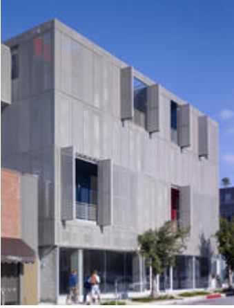
A street view looking northwest is shown in the photo.

This urban infill, mixed-use, market-rate housing project was designed to incorporate green design as a way of marketing a green lifestyle. It is pending LEED Platinum certification. The design maximizes the opportunities of the mild Southern California climate with a passive cooling strategy using cross-ventilation and thermal convection while taking advantage of the abundantly sunny location. A commitment to minimizing the project's ecological footprint informed all aspects of the design.