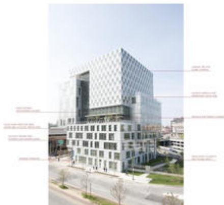
View from across Mount Royal Avenue showcasing the different features of the three façades.