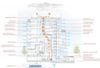
Diagram of East-West section showcasing the water and climate strategies in place. These involve collection and remediation of rainwater runoff, and the use of natural ventilation for portions of the year.

The Atrium provides opportunities for casual and planned encounters while doubling as a forum for special events for the school. It is filled with generous daylighting and equipped with LED 'butterfly' chandeliers.