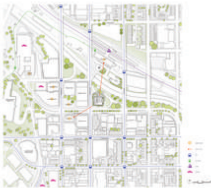
Context & Site Plan - Photo