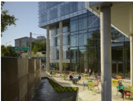
Sunken Garden located below grade at level 00 providing the site with visual and acoustical buffer to the freeway.