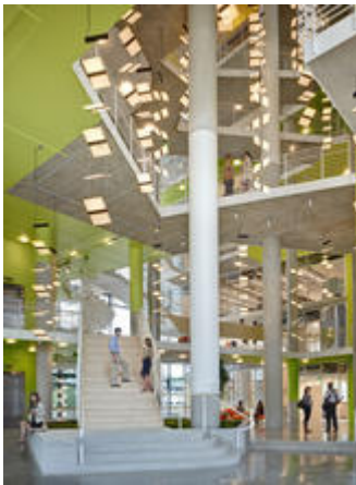
Entrance Lobby with "butterfly" LED Chandelier. The main entrance on level 01 brings users directly into the atrium, thereby promoting a sense of community within the school.