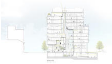
East-West Section showing daylighting in the building. - Photo Credit: Behnisch Architekten

The radiant slab system maintains the massive concrete structure at a stable temperature, while a low-volume dedicated outdoor air system with enthalpy wheel heat recovery provides ventilation when outdoor conditions are not favorable for natural ventilation.