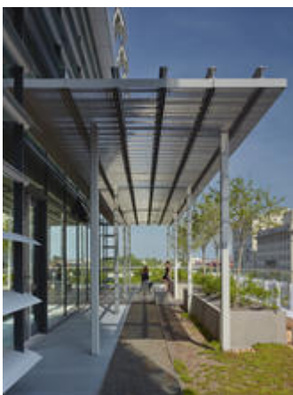
Roof terraces provide users with access to fresh air and collect rainwater runoff for remediation and reuse.