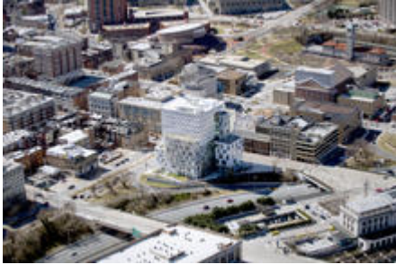
Aerial view from the Northeast showing the building's urban context.