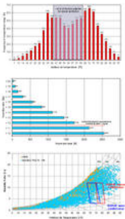
Temperature & Humidity Histograms for Baltimore Climate and Psychrometric/Bioclimatic Chart