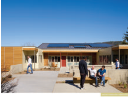
Entry Courtyard at Residence with solar thermal and photovoltaic panels

The project exceeds the AIA's 2030 Commitment for energy reduction, using 88% less energy than baseline including on-site renewable energy contribution.