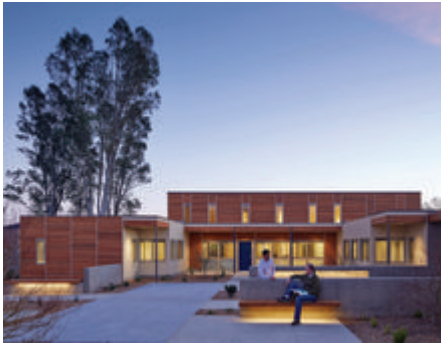
Entry Courtyard At Residence

Sweetwater Spectrum is a new national model for supportive housing for adults with autism, offering life with purpose and dignity. Created to address a growing housing crisis for adults with autism, this new community for sixteen residents integrates autism spectrum design, universal design, and sustainable design strategies.