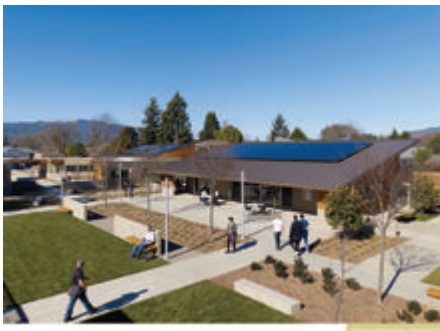
Community Center and Commons